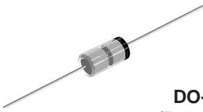
DO-204AH (DO-35 Glass)

Zener Voltage Range 3.0 to 75V Power Dissipation 500mW